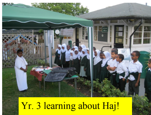
Yr. 3 learning about Haj'!